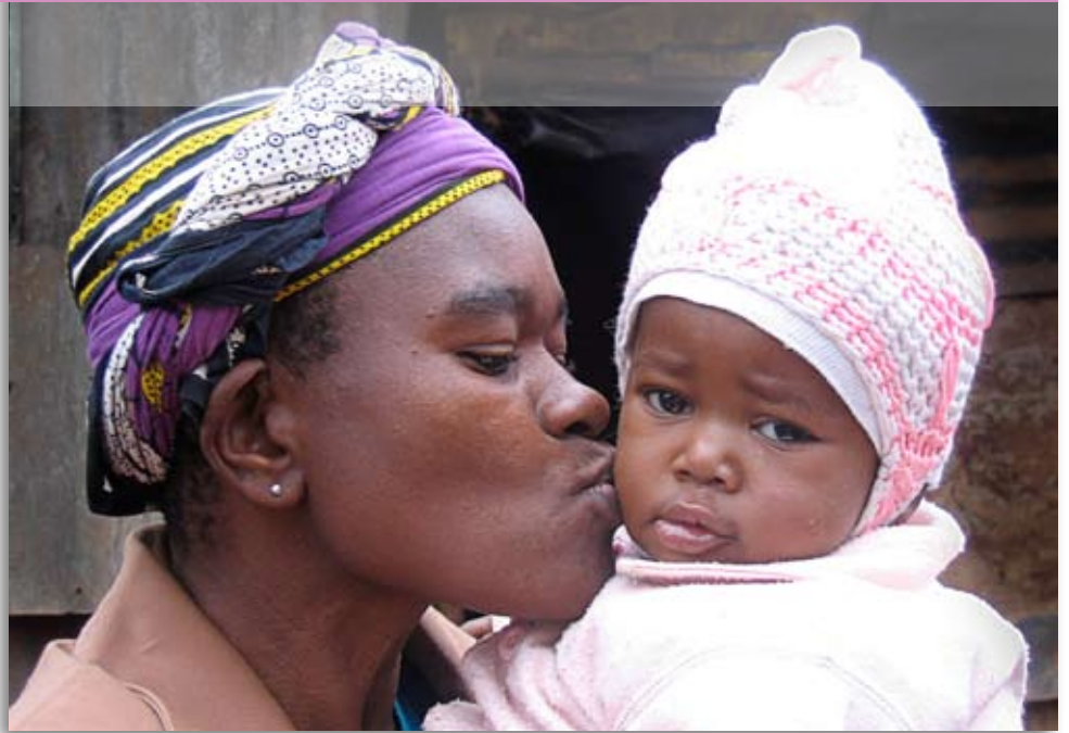
Kenyan mother and child

Evidence shows that legalizing abortion does not reduce maternal mortality